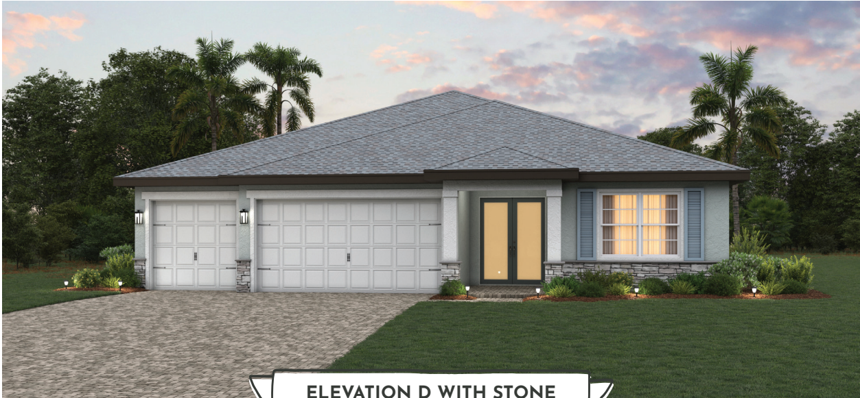
ELEVATION D WITH STONE

4 beds + den · 3 baths · 3-car garage · 2,635 sf a/c