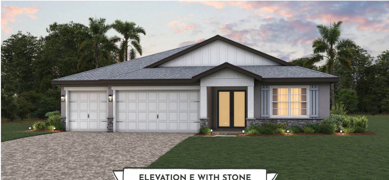
ELEVATION E WITH STONE