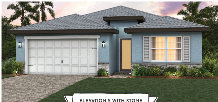
ELEVATION S WITH STONE