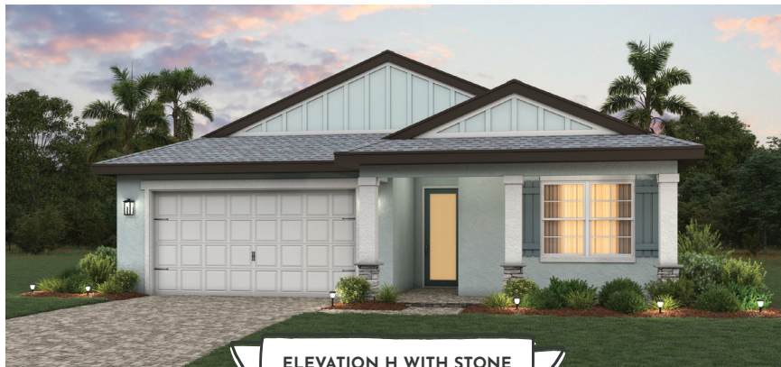
ELEVATION H WITH STONE