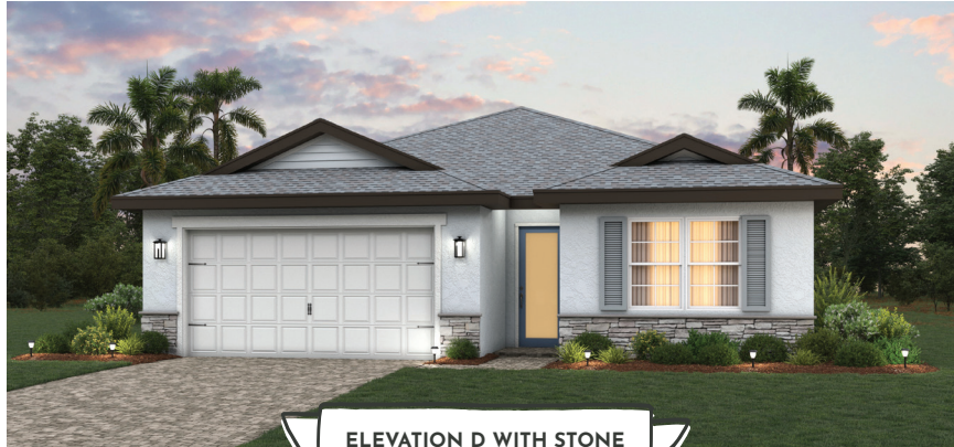
ELEVATION D WITH STONE

4 beds · 2 baths · 2-car garage · 1,810 sf a/c