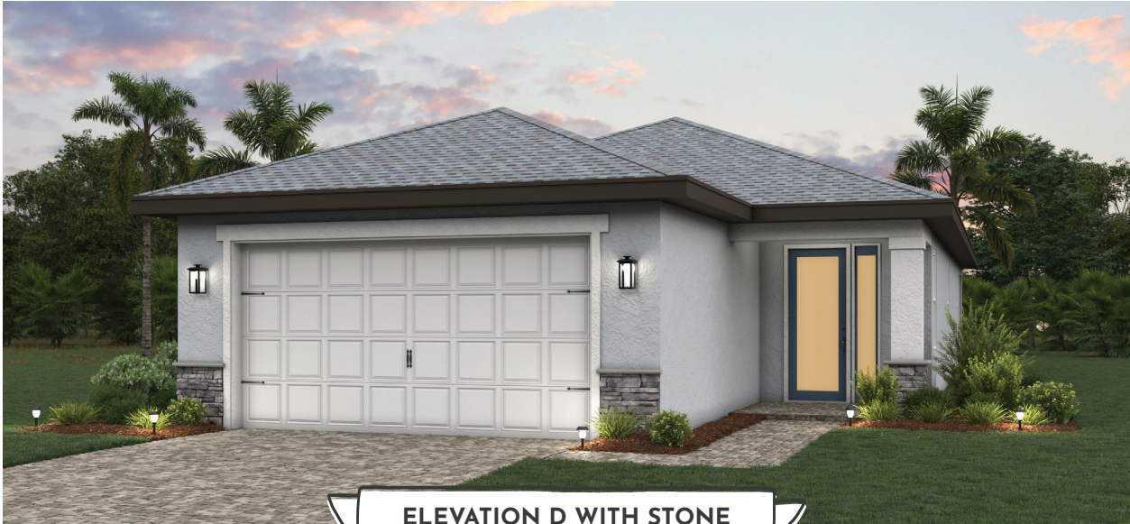
ELEVATION D WITH STONE

3 beds · 2 baths · 2-car garage · 1,630 sf a/c