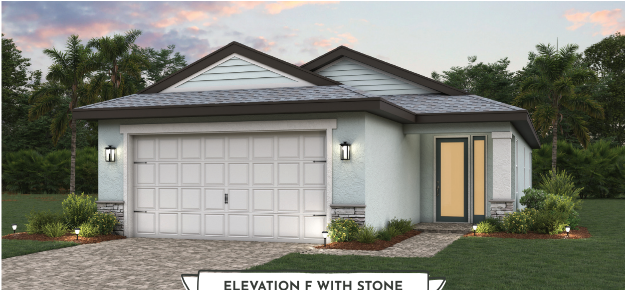
ELEVATION F WITH STONE