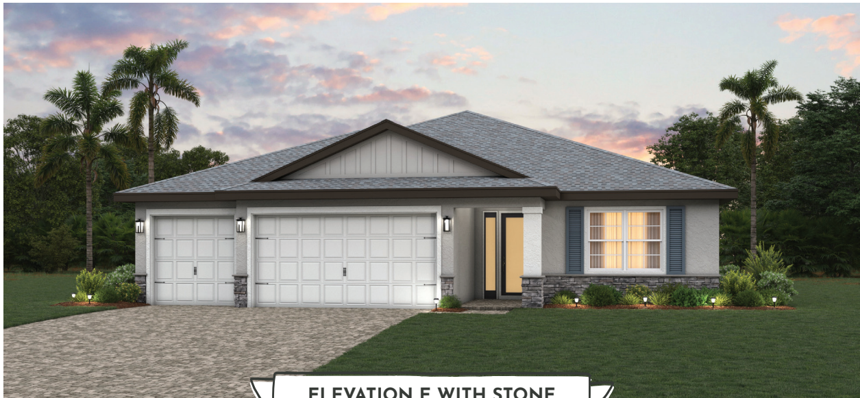
ELEVATION E WITH STONE