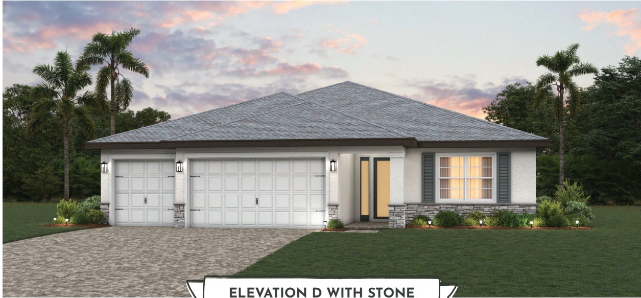
ELEVATION D WITH STONE

4 beds · 3 baths · 3-car garage · 2,205 sf a/c