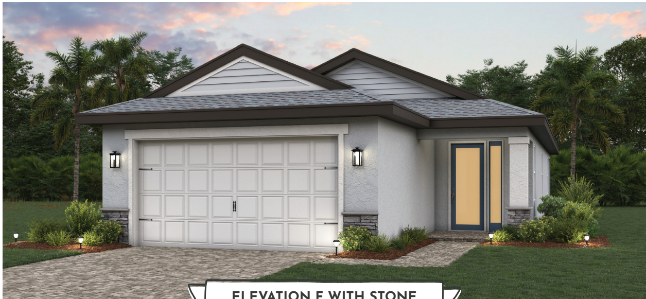
ELEVATION F WITH STONE